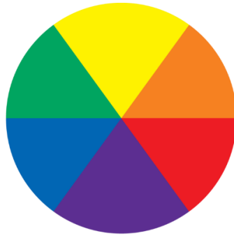
Primary Colors, and Secondary Colors