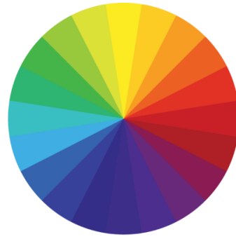
Primary Colors, Secondary Colors, and Tertiary Colors